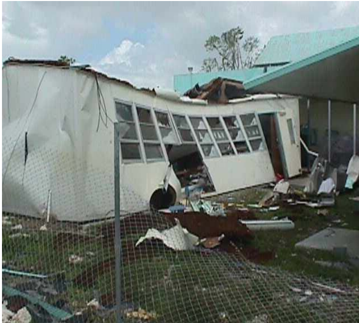
Infrastructure Damaged or Destroyed